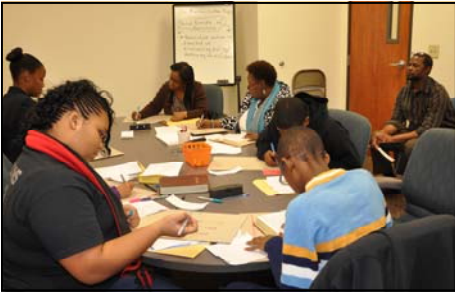
Middle school breakout session

The churches partnered together and welcomed other churches in the Region to join them and bring their children, youth, and young adults to learn the six non-violent principles of the great civil rights leader, preacher, and national giant. Over 60 persons were in attendance.