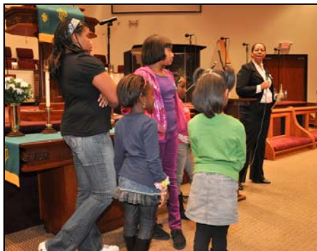
Elementary participants sharing.

This segment ended with all the groups singing a tribute to Dr. King – Donald Lawrence's, There is a King in You , which reminded all participants of their "royal" heritage in God.