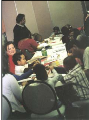
Primary students at work