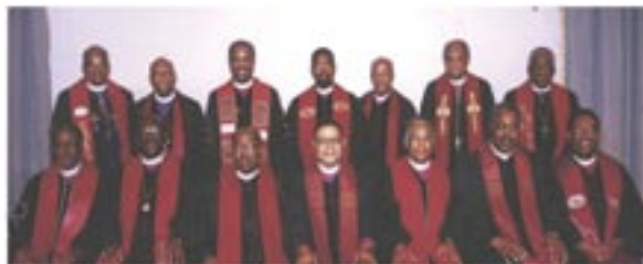
College of Bishops, Christian Methodist Episcopal Church

OCOS is proudly sponsored by the CME Church, other ecumenical denominations, the corporate community and school partners.